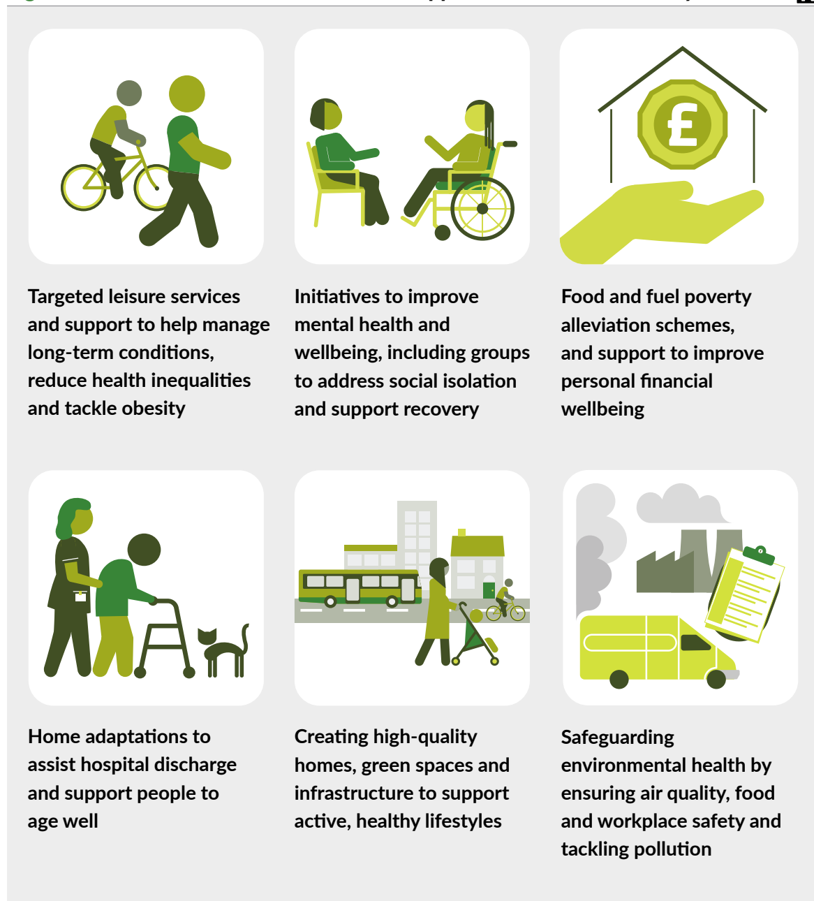
Figure 1 How district council services can support the health and care system K

holistic way of thinking about what produces good health outcomes for local people, and deliver the shift towards prevention called for in The NHS long term plan (NHS England 2019).